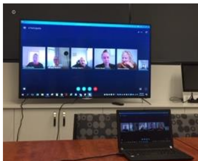
3/4 Team meeting